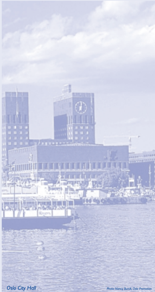
Oslo City Hall