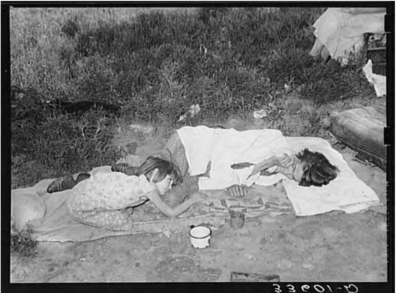
Starvation, Sequoyah County, OK, 1939