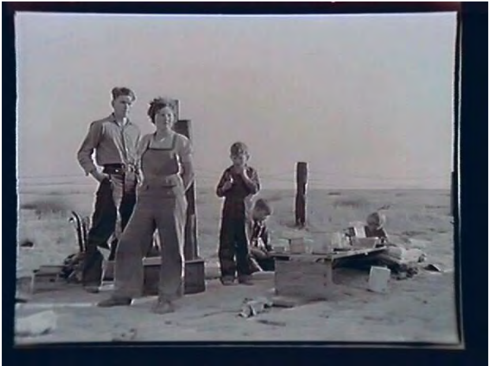
Migrant family at roadside, OK, 1937