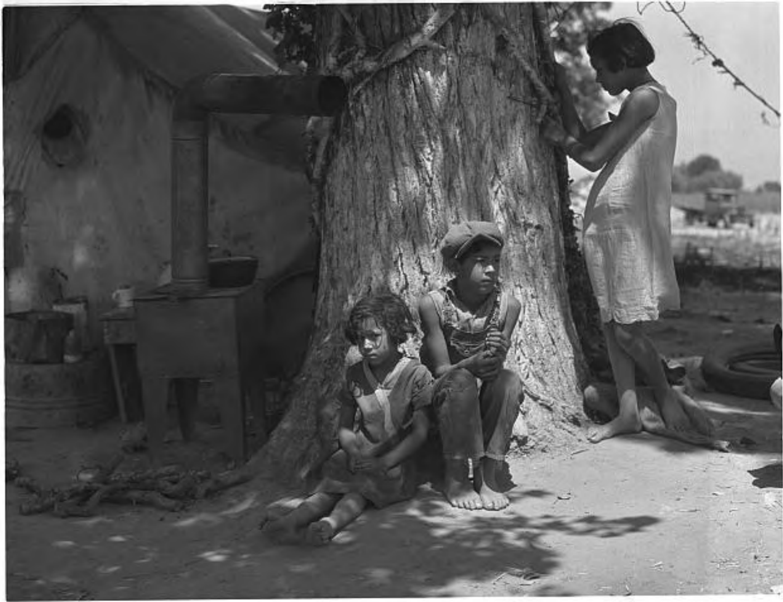
Orphaned refugee children, California, 1935