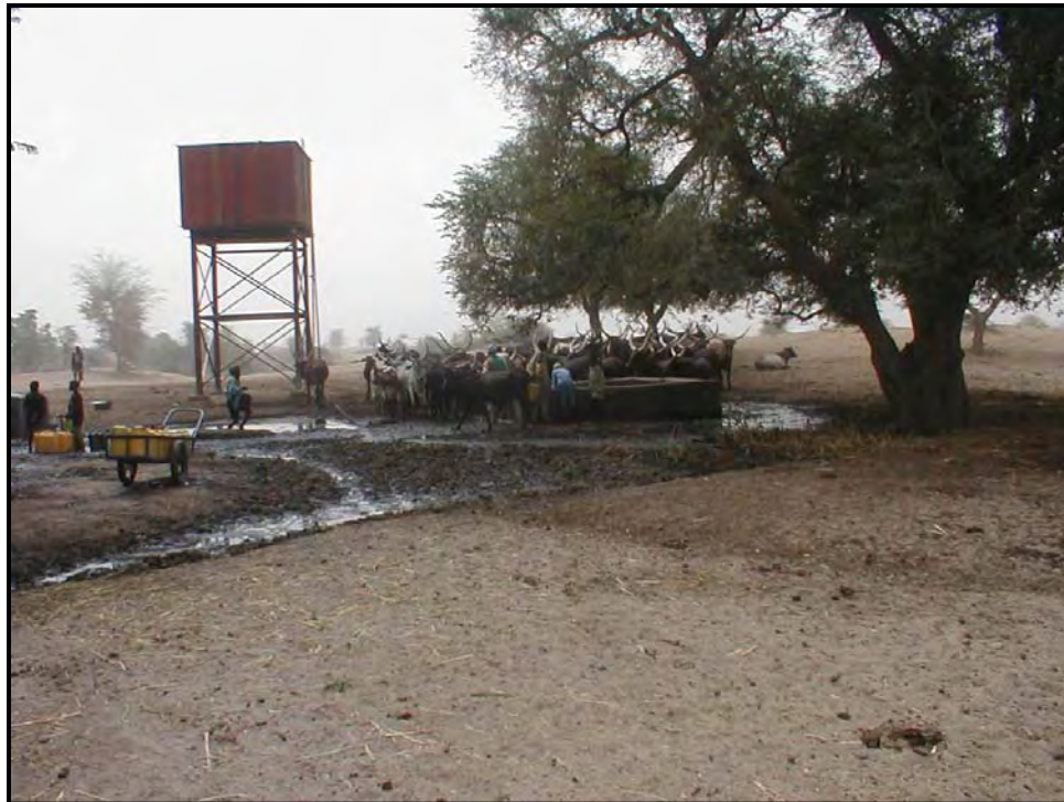
Northern Nigeria, 2005