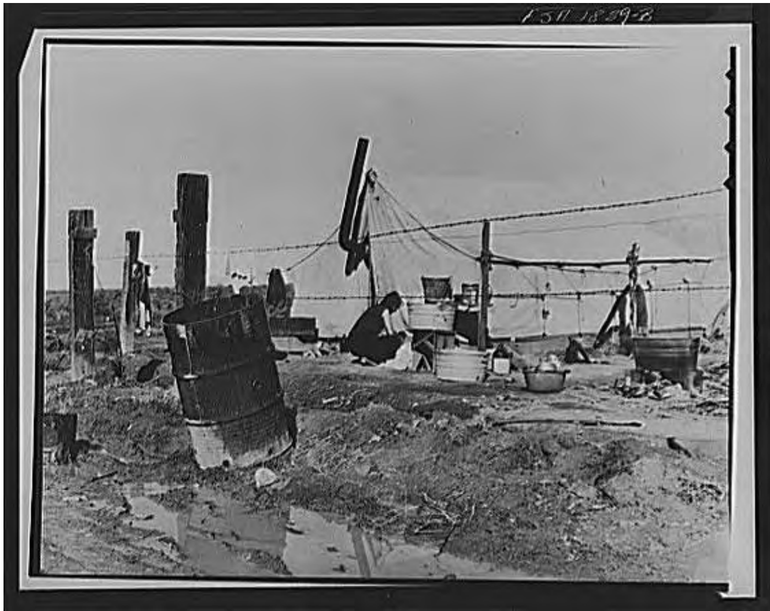
Refugee camp, rural California 1936