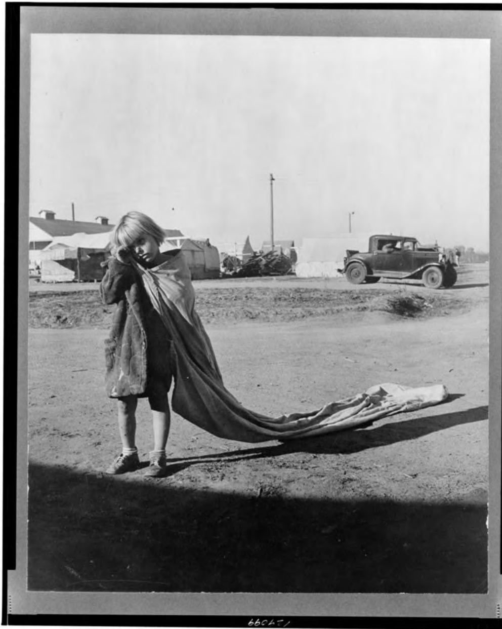
Child labourer, Kern County, CA 1938